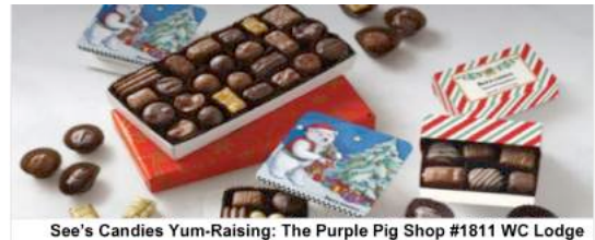
See's Candies Yum-Raising: The Purple Pig Shop #1811 WC Lodge

We have partnered with See's Candies just in time for this Holiday Season. Please take a moment to visit our Yum-Raising Shop. Reach out to your family, friends and co-workers and ask for their support of our California-Hawaii Elks Association Major Project for Disabled children, the PURPLE PIG. Your purchases will help us achieve our fundraising goals.