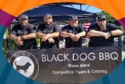
Black Dog BBQ available for purchase