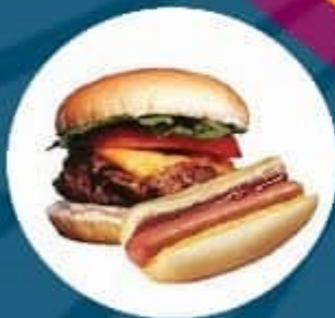
Hot Dogs and Hamburgers available for purchase

At the Tri-City Elks, West Shore Rd. Warwick