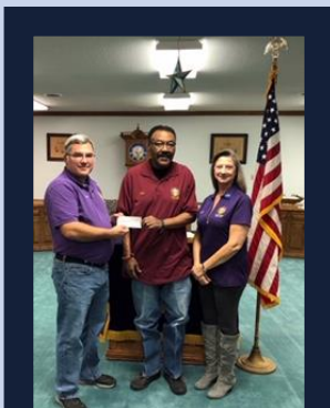
Donation for Veteran's Meal