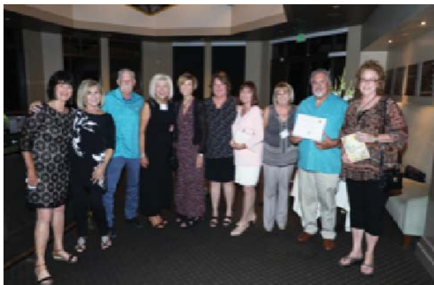
Stockton Hospice of San Joaquin Butterfly Auxiliary Honor Stockton Elks Lodge #218 as Community Partner of 2019 at their annual Recognition Dinner September 26, 2019. Stockton Lodge #218 is a community partner for our continued support to the Butterfly Auxiliary.