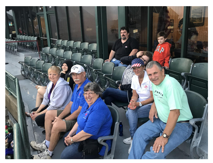
Box Seats at Somerset Patriots