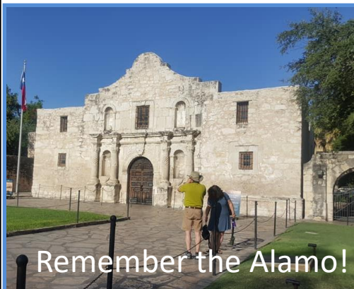
Remember the Alamo!