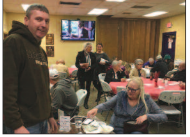
Elkettes Souper Saturday