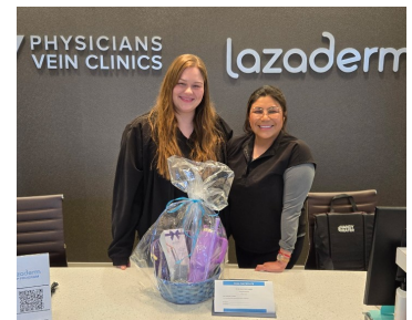
Physicians Vein Clinic, Lazaderm & Big Mama's Coffee donated baskets