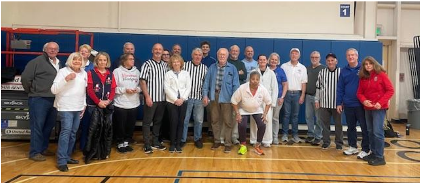
Hoop Shoot volunteers