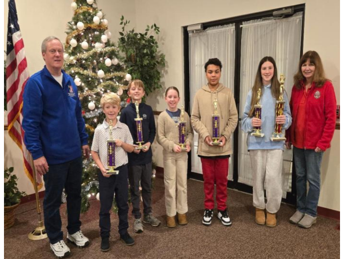
Lodge Hoop Shoot Winners moving on to District Hoop Shoot on January 4, 2026