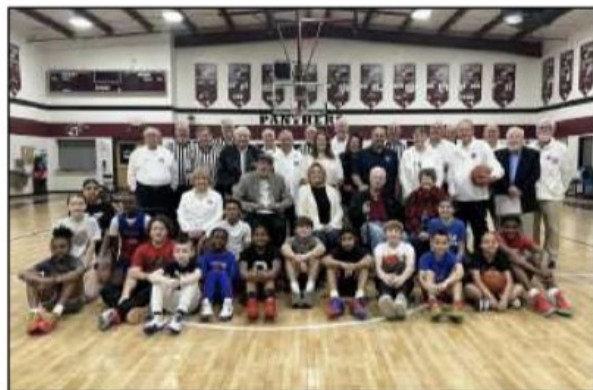
State Hoop Shoot participants and volunteers.