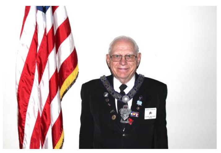
2 YEARTrustee: William Lakers PDDGER/PER