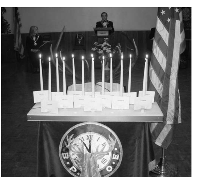
Memorial Service, December 6th