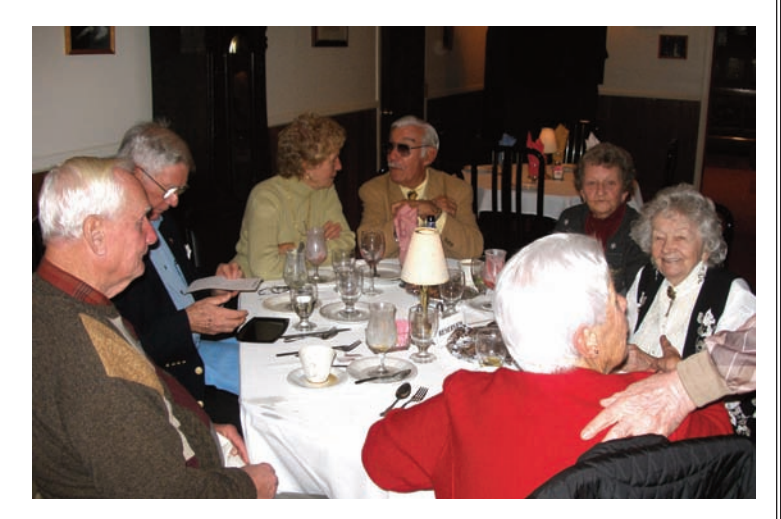
Members and guests enjoying dinner at Jazz Night