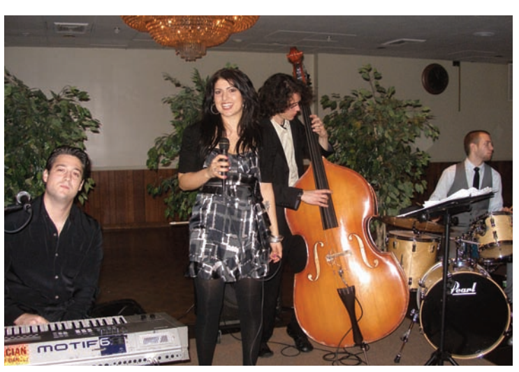
Halley's Comets, Jazz Night, December 4th