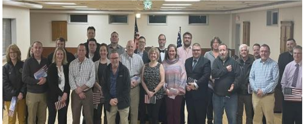
Welcome to the new Members of Rensselaer Elks Lodge 2073!