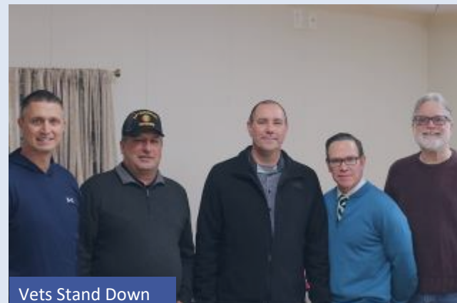
Vets Stand Down