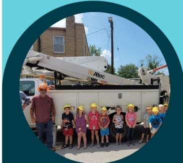
Pictured above: Bates County, Mo., Lodge No. 2653 used a Beacon Grant to host Safety Village, a weeklong event that taught preschoolers about real-world safety. Throughout the week, 28 kids participated in fun activities and listened to guest speakers, including a police officer and fire fighter.