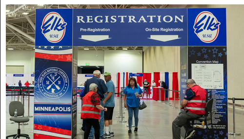
Registration area at the 2023 convention

Grand Lodge registration and its required fee are not included in any State Association's "package" arrangement.