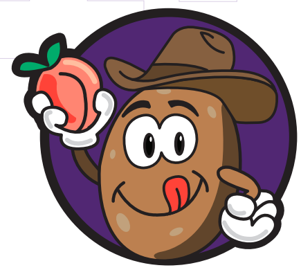
A convention tradition, the popular Idaho potato patch sports a Georgia theme.