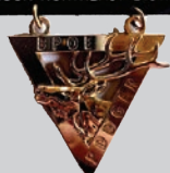
Past Exalted Ruler Badges