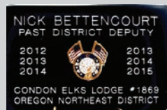
Past District Deputy Badge