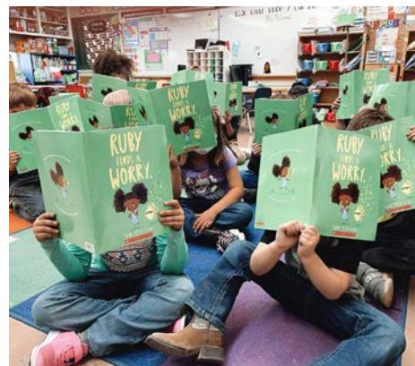
Donate gently used children books for a chance to win a bonus $2,000 Community Investments Program Grant for your Lodge.

Can't get enough service? Neither can Elks scholars. Several 2022 Most Valuable Student scholars are in Atlanta right now on an Elks Scholar Service trip. This weekend they assembled hygiene kits for veterans in need, and they will be serving at local nonprofits, including the Atlanta Community Food Bank and Truly Live Well Urban Farm. They'll also be spending some time at the ENF booth, so stop by for a chance to say hello!