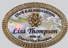
Mother of Pearl Name Badge (Not cut at grand lodge)