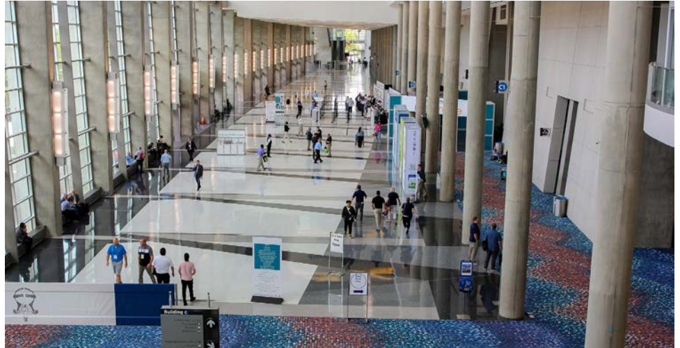
The Elks Convention will be held in Georgia World Congress Center, Building C.