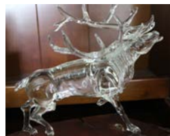
Crystal Elk Award