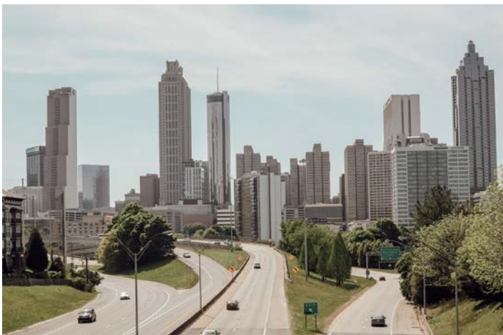
Downtown Atlanta.

docket are reports from the Elks National Convention Commission, National Memorial & Publications, Veterans Restoration Trust, and the Board of Grand Trustees, plus a preliminary report from the Committee on Judiciary. The session caps off with the nomination and election of Grand Lodge Officers for 2022-2023, with the Celebration and Grand Exalted Ruler-Elect acceptance speech.