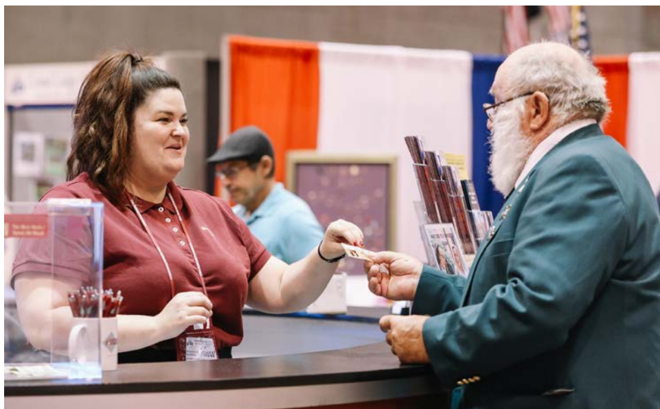
ENF staff members can answer your questions at their booth during convention

Monday, 12:30 to 1:30 p.m., GWCC Room C108