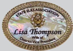
Mother of Pearl Name Badge (Not cut at grand lodge)