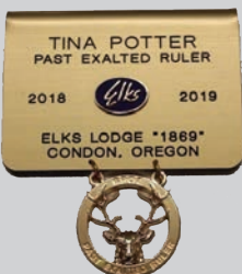
Past Exalted Ruler Badges