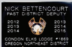
Past District Deputy Badge