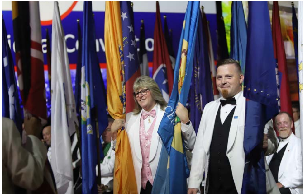
The Parade of Flags during the Opening Ceremony.