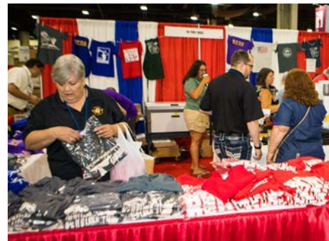
Convention vendors are back for 2022

FINAL FOUR CONTEST: Monday, July 4, 10:00 a.m.