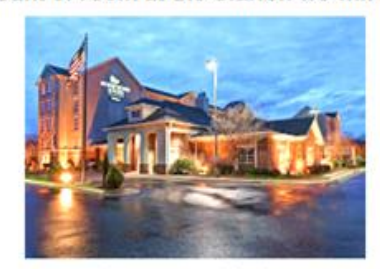
Homewood Suites 1040 Hospitality Ln, Fredericksburg VA 22401 Room cost $139 plus Tax

Due to the limited amount of room at the Clarion we will have an overflow Hotel