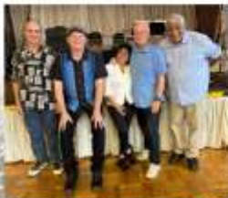
20th American Roots Birthday Dinner

Bar Opens 4PM Dinner 5-7:30PM Dancing 6-9PM Close Dec. 27th