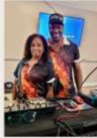
Sir Lou December 7th and 14th