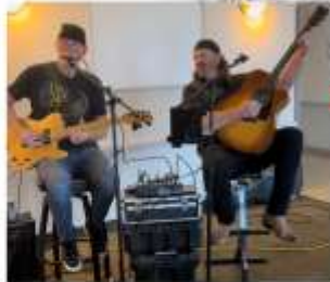
13th All Strung Out