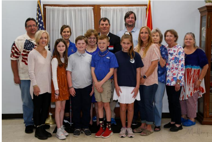
Americanism Contest winners in our area

Your Americanism Committee at the Gainesville Elks Lodge hosted a reception Saturday honoring the Students and Teachers from High Springs Community School who participated in the Grand Lodge Americanism Essay Contest. Four of the six students and their families as well as the two teachers who encouraged the students to participate were in attendance. Each student and both teachers were recognized individually and received a formal Certificate of Participation as well as a $25. Visa gift card. Many thanks to the individuals who donated the money that enabled us to give these gifts. Three of the six essays were forwarded to the "Mighty Northeast District" level contest. All three were then forwarded to the State of Florida level contest for their age category.