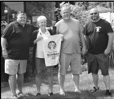
Elks on the Move

We are scheduling a larger Bed Brigade delivery on Saturday 10/15 (OSU has a bye) and we are looking for additional Elk members and/or spouses/family to help deliver beds to the needy. We will start at 10:30AM to load up our deliveries in trucks, deliver the beds and for those that want, we will meet back at the Elks lodge to watch some college football. If you would like to help in this delivery please contact Dave Roasa 614-397-4278 or Jim Gillespie 614-886-6986. There will also be a sign up sheet in the lodge. Sign up to help make a difference in the lives of others, you may also gain something from this experience.