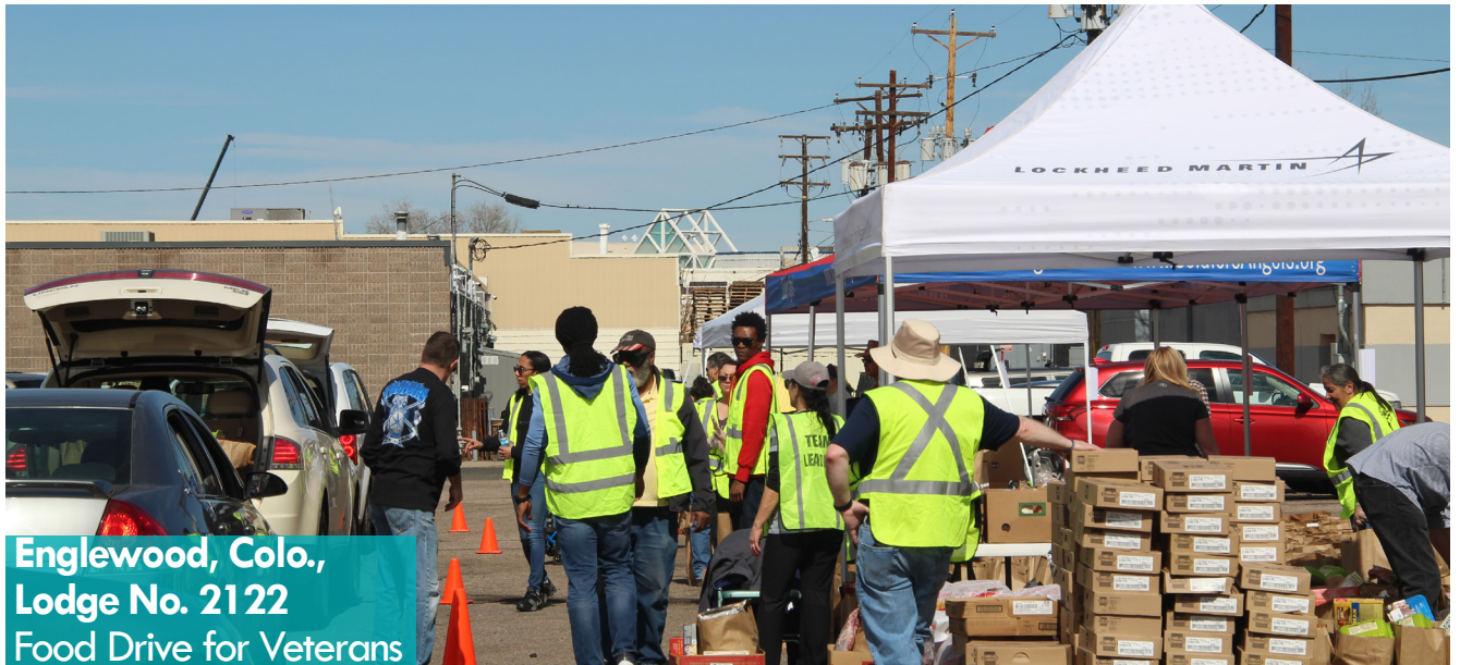
Englewood, Colo., Lodge No. 2122 Food Drive for Veterans