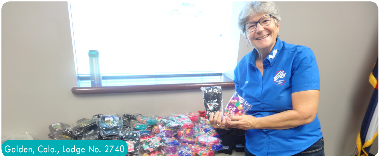
Golden, Colo., Lodge No. 2740

This year, Lodges will have the opportunity to apply their Spotlight Grant to increase their Beacon Grant budget to $5,500.