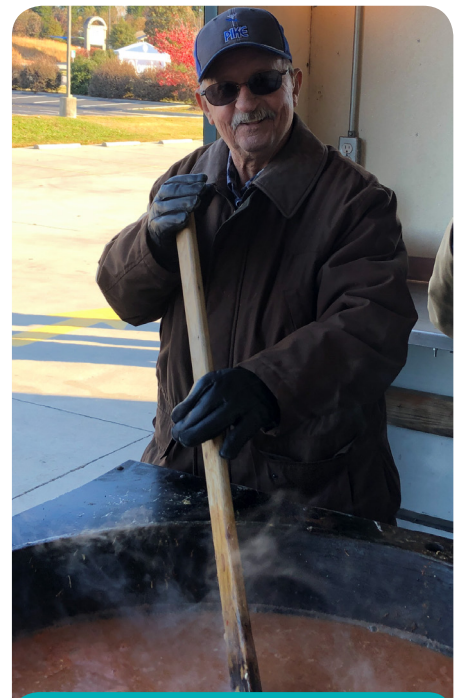
Danville, Va., Lodge No. 227

Fill out the Beacon Grant application as usual. Make sure to use the full grant amount!