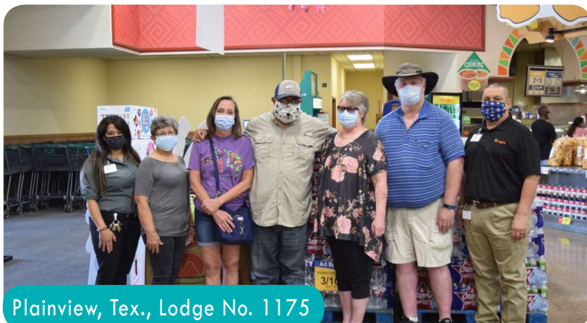
Plainview, Tex., Lodge No. 1175

For more information about the Spotlight Grant, please visit enf.elks.org/SpotlightGrants