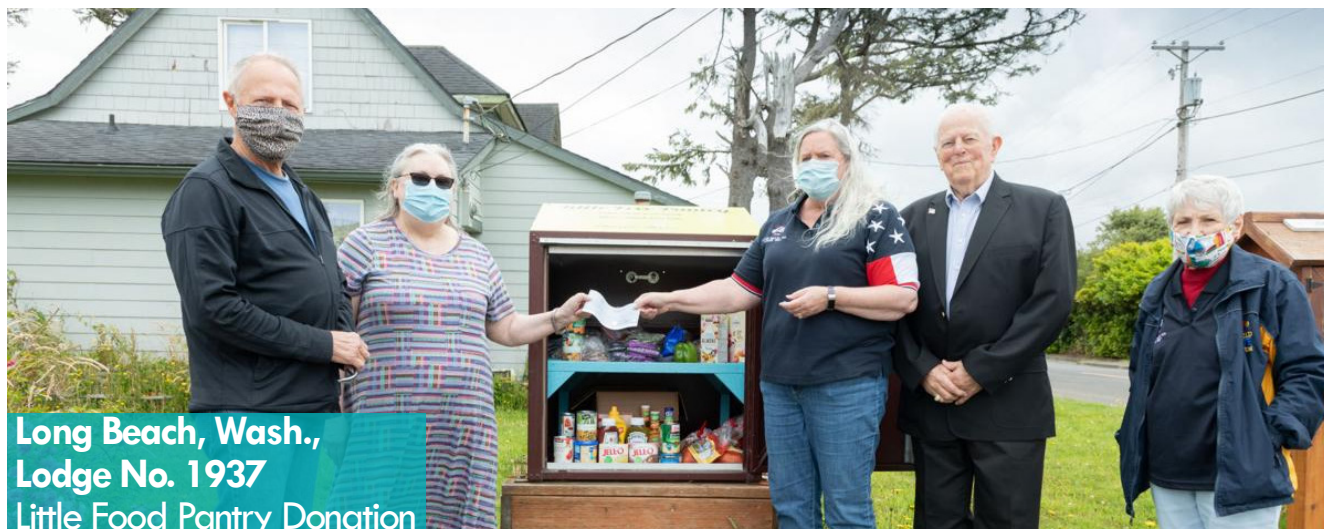
Long Beach, Wash., Lodge No. 1937 Little Food Pantry Donation