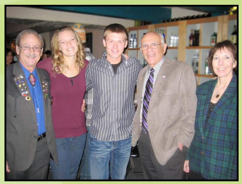
Elks scholars in the Denver area share dinner and conversation with their Elks family.

• Dallas, TX – ENF Staff attended a Regional Hoop Shoot contest in the Dallas area in late March 2011 While there, they hosted a dinner for friends of the ENF and two local Elks scholars.