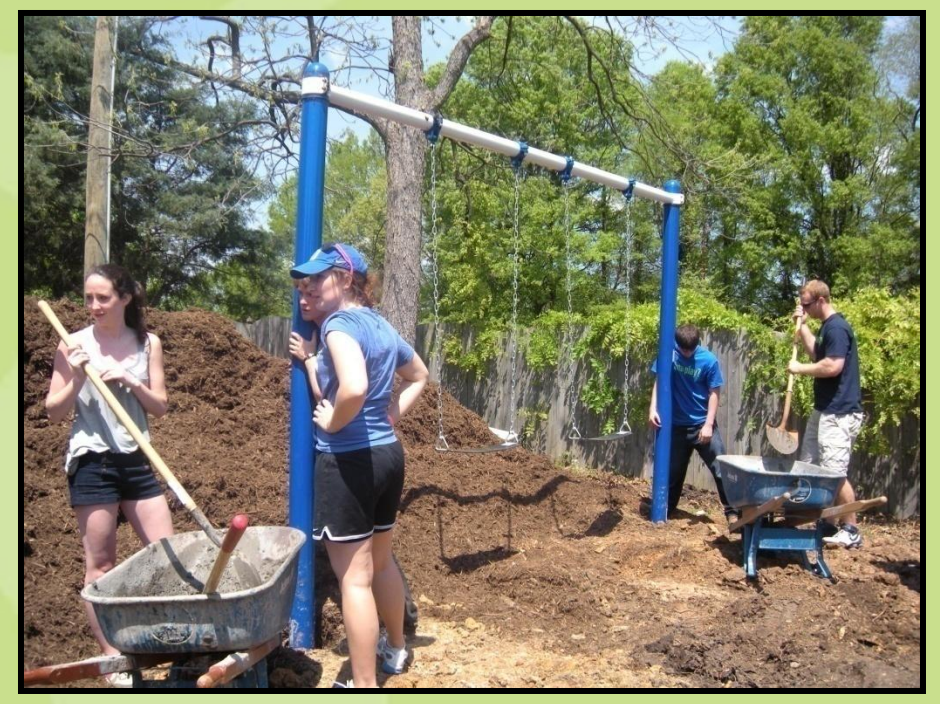
Duke University Elks scholars build a playground at the Durham Crisis Response Center.