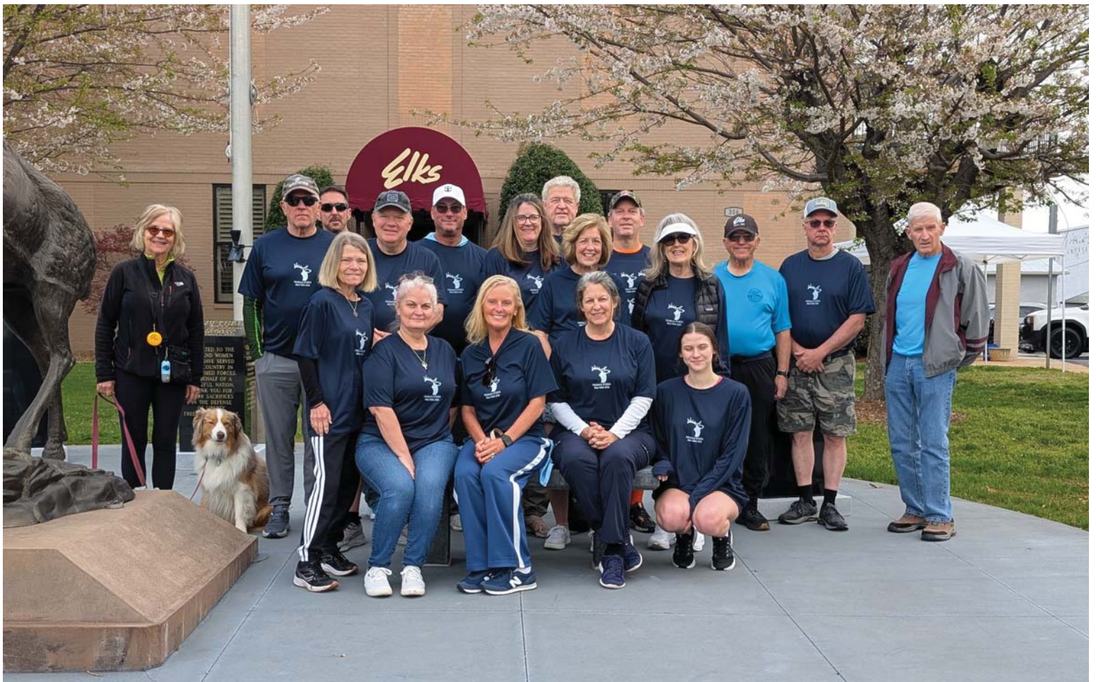
Walk/Bike raises about $7800, WELCOME NEW OFFICERS