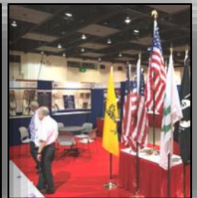
Exhibit Hall Displays

Next year we will be celebrating the 150th anniversary of the BPOE. This is a big deal and there are lots of plans to make this a big year for the Elks.