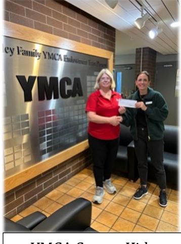
YMCA Strong Kids