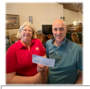
Barnabas Coffee House