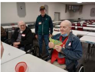
Winner winner chicken dinner!