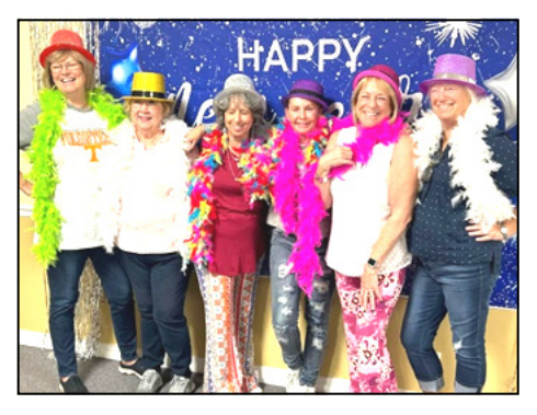
And, the party kept going for a few people on New Years Day