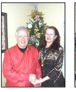
New Year's Eve Party