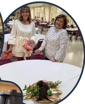
Working behind the scenes for Member Appreciation Dinner.