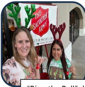
"Ring the Bell" day for the Salvation Army!