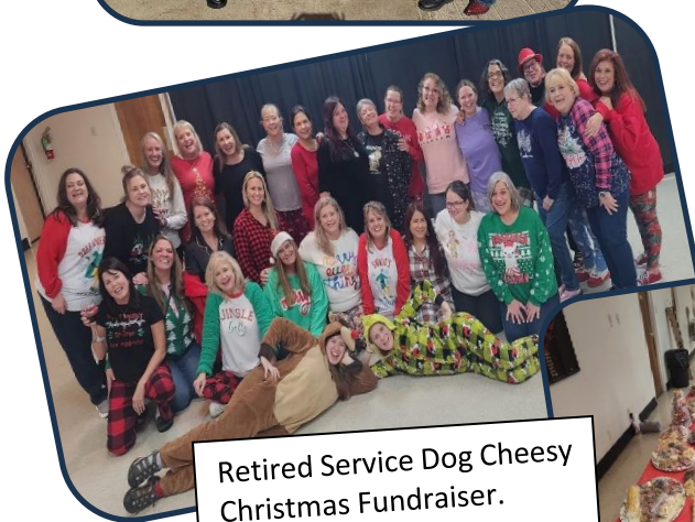
Retired Service Dog Cheesy Christmas Fundraiser.