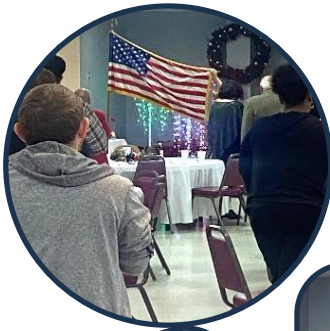
Homeless Veterans Program Christmas Party