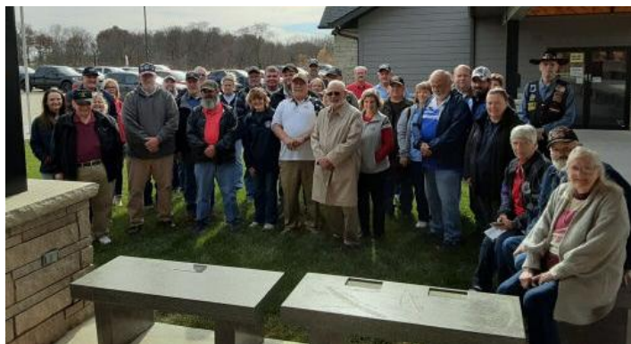
Perryville Bench Dedication

Hunters, we want your deer hides for the Elks National Veterans Leather program. Your donated hides will be prepared and shipped to the tannery, processed into leather and cut into wheelchair gloves and activity projects for the hospitalized veterans. In the recent reporting, 13,401 hides were collected, 1,059 veterans received wheelchair gloves and 71,294 square feet of leather was provided for craft kits. These items are provided free of charge to the vets. Missouri has led the nation in hides donated, and this district has been on the top of the list in the state. Let's keep up our support for this program for our veterans. Hides should be in a plastic bag and put in the freezer next to Wink's Cafe at the end of the parking lot. Anyone can donate hides.