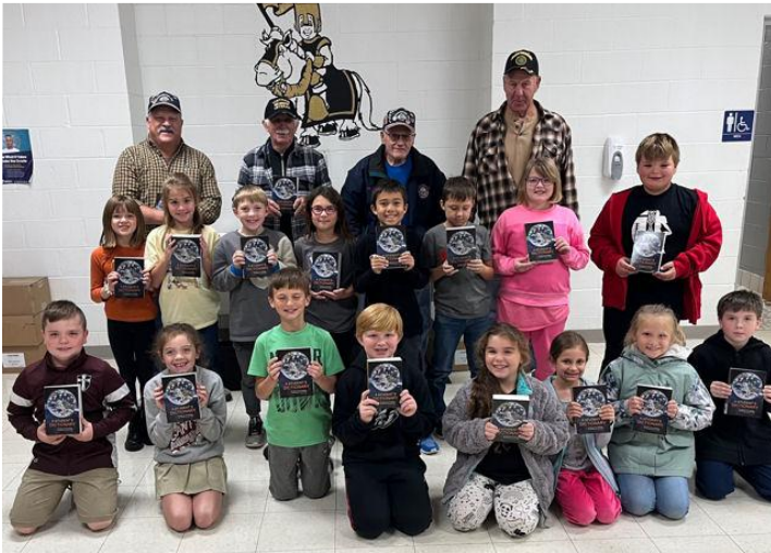
Delivering dictionaries to St. Joseph, St. Paul, Roosevelt, and Jefferson Elementary Schools.