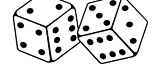
Join us for BUNCO Night! Tuesday Night December 5th at 6:30pm!

$5 Entry - all proceeds go to the winners! Ready, Set, Roll! It's Easy to Learn, Easy to play! Bring a snack to share!