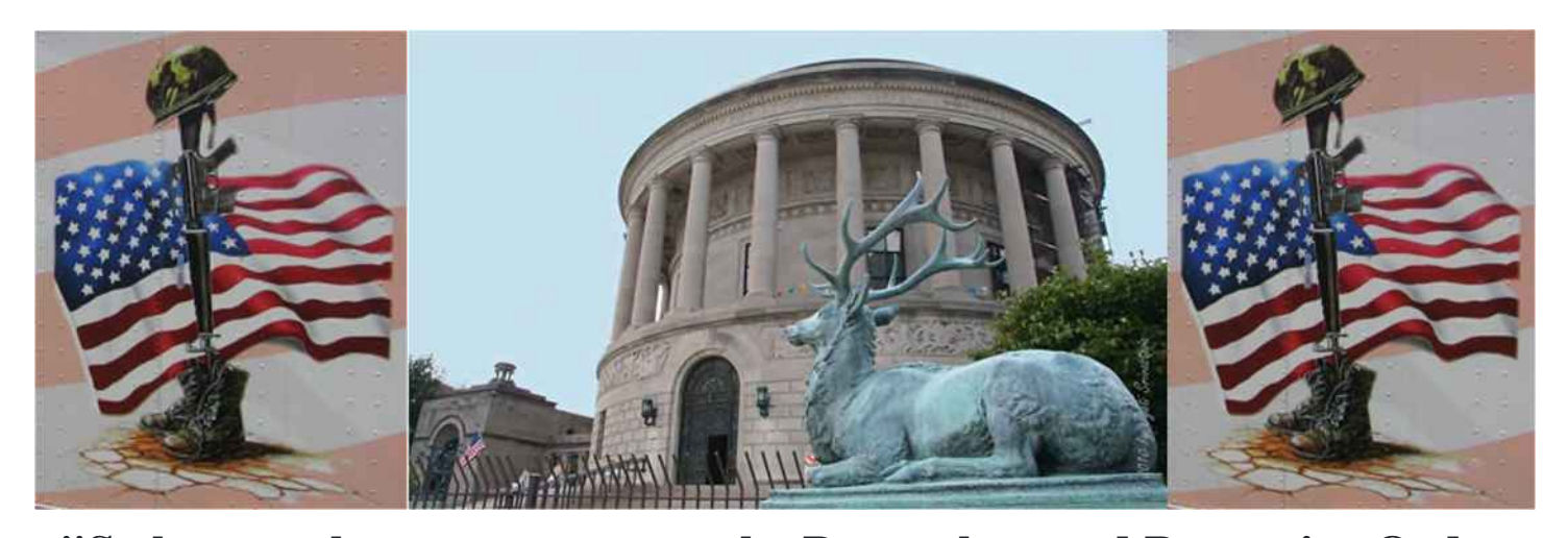
"So long as there are veterans, the Benevolent and Protective Order of Elks will never forget them."

Come join us to honor our Veterans on Wednesday November 8<sup>th</sup>, 2023!