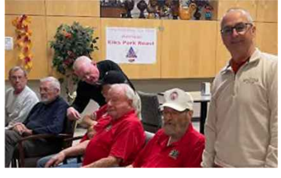
"So long as there are veterans, the Benevolent and Protective Order of Elks will never forget them." Elks Do Care, Elks Do Share.