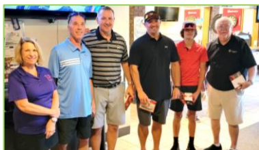
1st Place Team-Team Stricklin