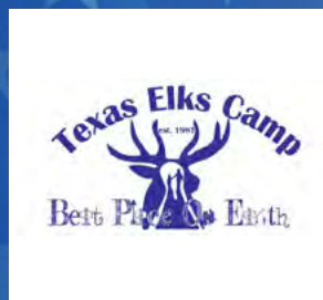
Texas Elks Camp