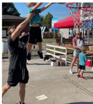
Photos: 2022 Spot Shoot