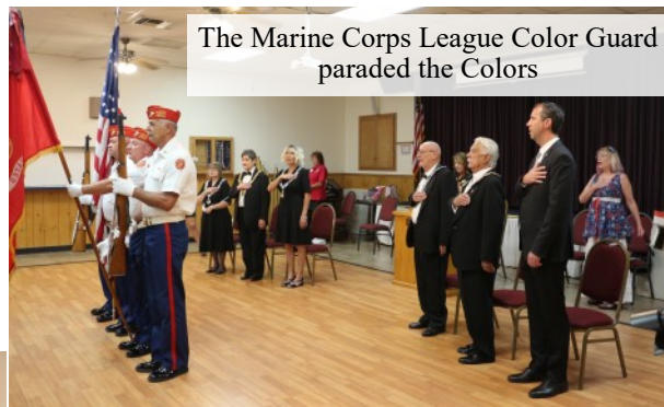
The Marine Corps League Color Guard paraded the Colors