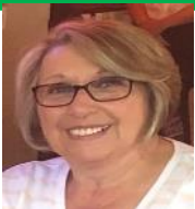
From the Office of the Lodge Secretary