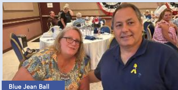
Blue Jean Ball