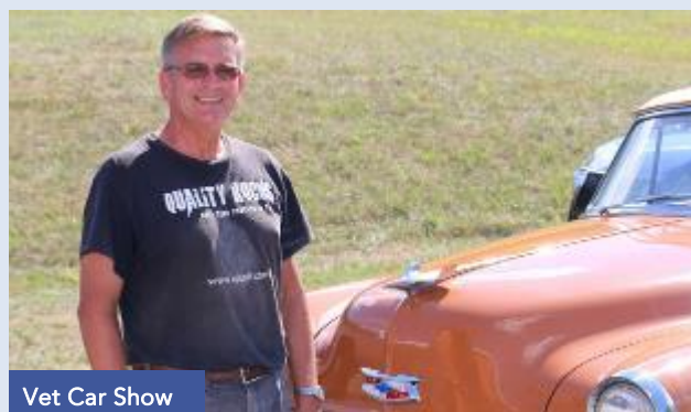
Vet Car Show