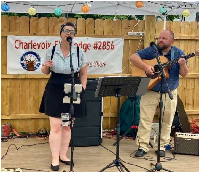
The Significant Others