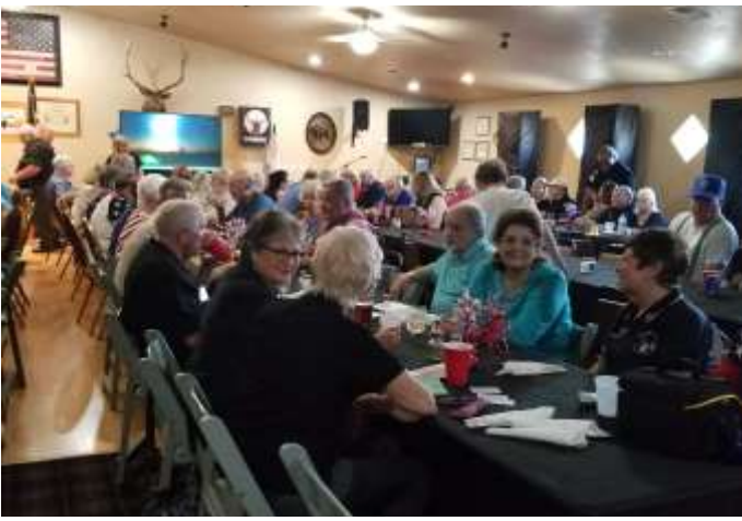
The busy Elks packing hot dogs at the Lodge for the Mesquite Night Out event. We served over 800 hot dogs and bottles of water to the community during the night. A huge thanks to our Lodge members who volunteered to help with this event.