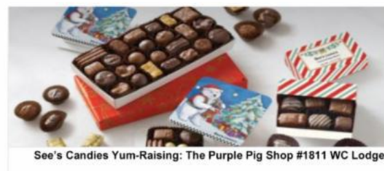
See's Candies Yum-Raising: The Purple Pig Shop #1811 WC Lodge

We have partnered with See's Candies just in time for this Holiday Season. Please take a moment to visit our Yum-Raising Shop. Reach out to your family, friends and co-workers and ask for their support of our California-Hawaii Elks Association Major Project for Disabled children, the PURPLE PIG. Your purchases will help us achieve our fundraising goals.