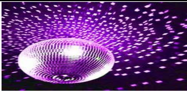
Purple Ball Pictures