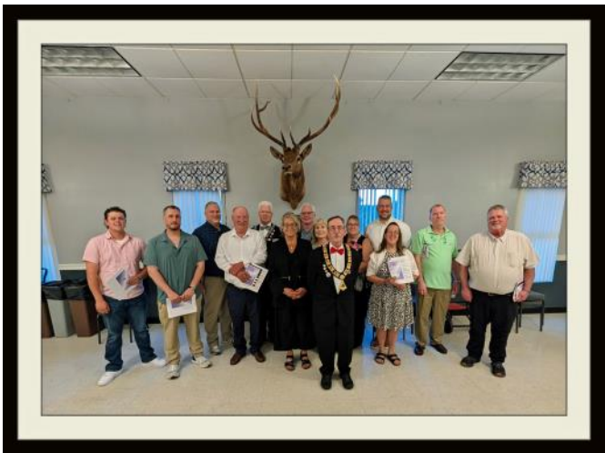
Initiation photo by Tom "The Tiler" Prindle