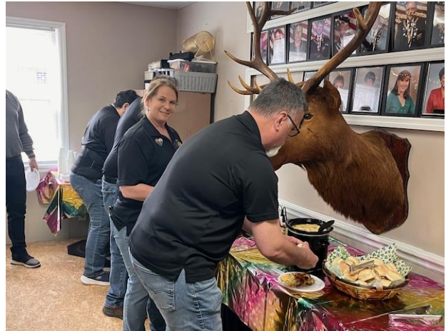
A picture of the current and future President entourage

State President Entourage going through the brunch line, watch out for that..... Elk