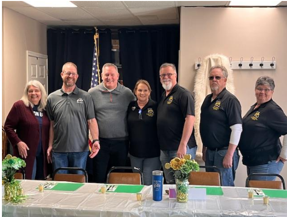
Picture of Ellisville Lodge #2664 Officers, Members, District Officers, and State Entourage