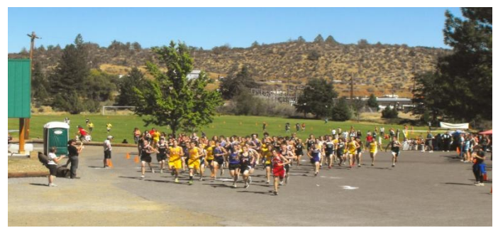
Elks Invitational Cross Country Meet 2011