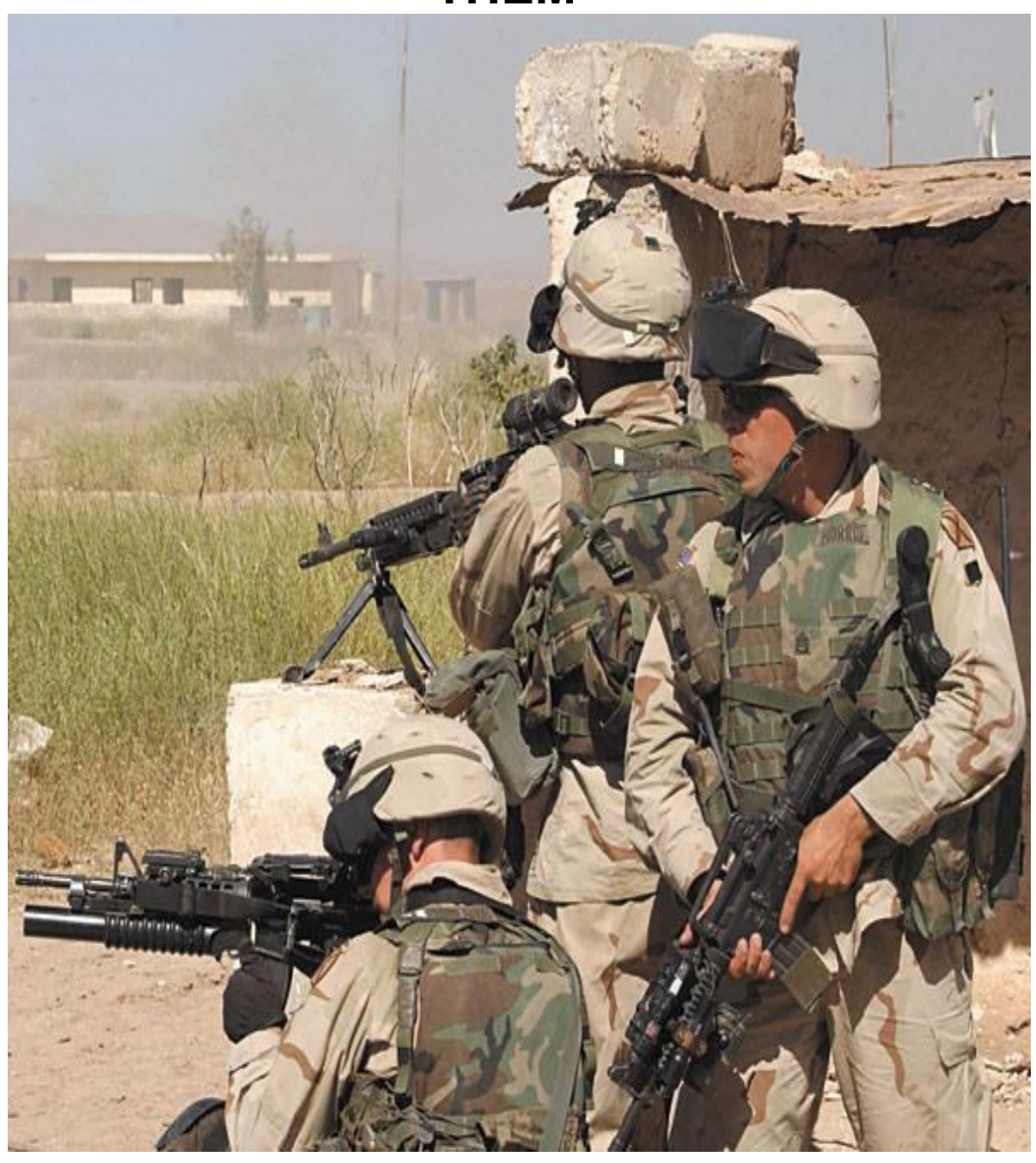
10<sup>th</sup> Mountain Division Iraq