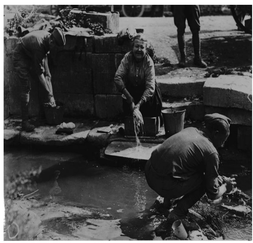
131 Infantry Division - U S Army