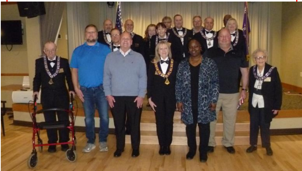
February's Initiation Class