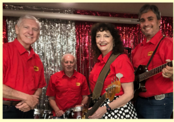
The Marvels 7:00 – 10:00pm

PLEASE RSVP TO THE OFFICE SO NO ONE LEAVES HUNGRY (909) 984 - 2777