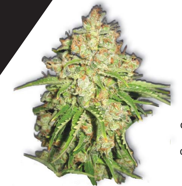
www.true compassion .org

reject raw marijuana as a medicine. The Institute of Medicine concluded there is no future for smoked marijuana.