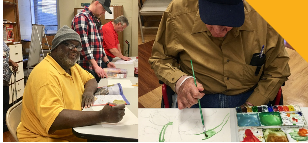
Lake Oconee, Ga., Lodge No. 2849 used its Freedom Grant to launch an art therapy program at the Georgia War Veterans Home to help veterans with PTSD express themselves.

Altogether, these projects served 42,416 veterans and military members, meeting needs that might otherwise go unfulfilled.