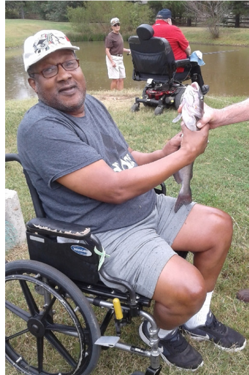
Fayetteville-Springdale, Ark., Lodge No. 1987 hosted veterans from local nursing homes for two fishing derby events with lunch and prizes.