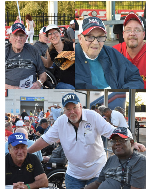
East Stroudsburg, Pa., Lodge No. 219 hosted a trip to a RailRider baseball game with dinner for veterans from the Wilkes-Barre VA Hospital.