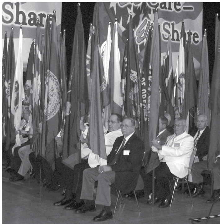
State Presidents wait to present their flags at the Opening Ceremony.